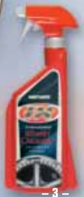
FX® Wheel Cleaner

See individual product labels for specific application information.